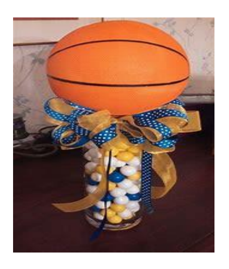
SAVE This Date!!!!